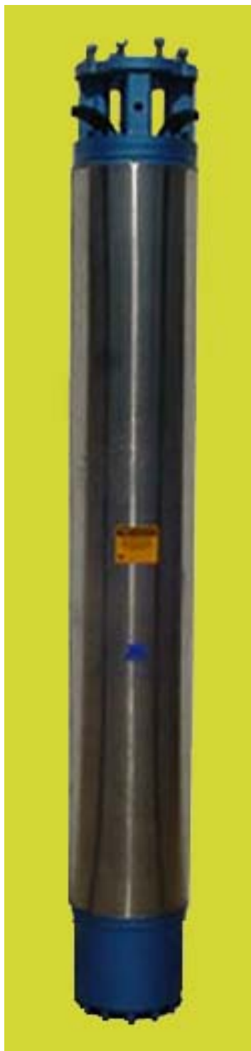
IMAGEN Y DIMENSIONES